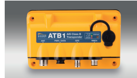
Micro USB connection located under rubber seal on top of ATB1

A leader in life-saving maritime products for the professional and leisure markets, Ocean Signal yet again provides the ultimate in safety and peace of mind with the ATB1 Class B Transponder.