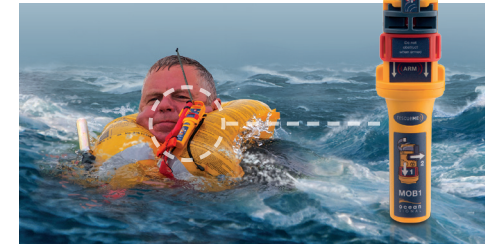
The ATB1 will relay MOB1 transmissions to your AIS Alarm or plotter