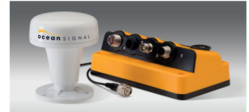
External mount GPS antenna supplied with the ATB1