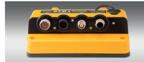
Simple easy access connections